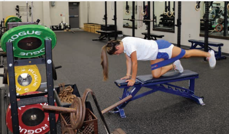
A student works out in the strength training area of the training facility.