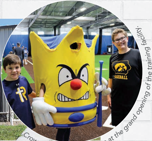
Crownie poses with students at the grand opening of the training facility.