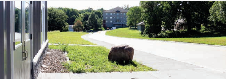
New First Avenue entrance/exit