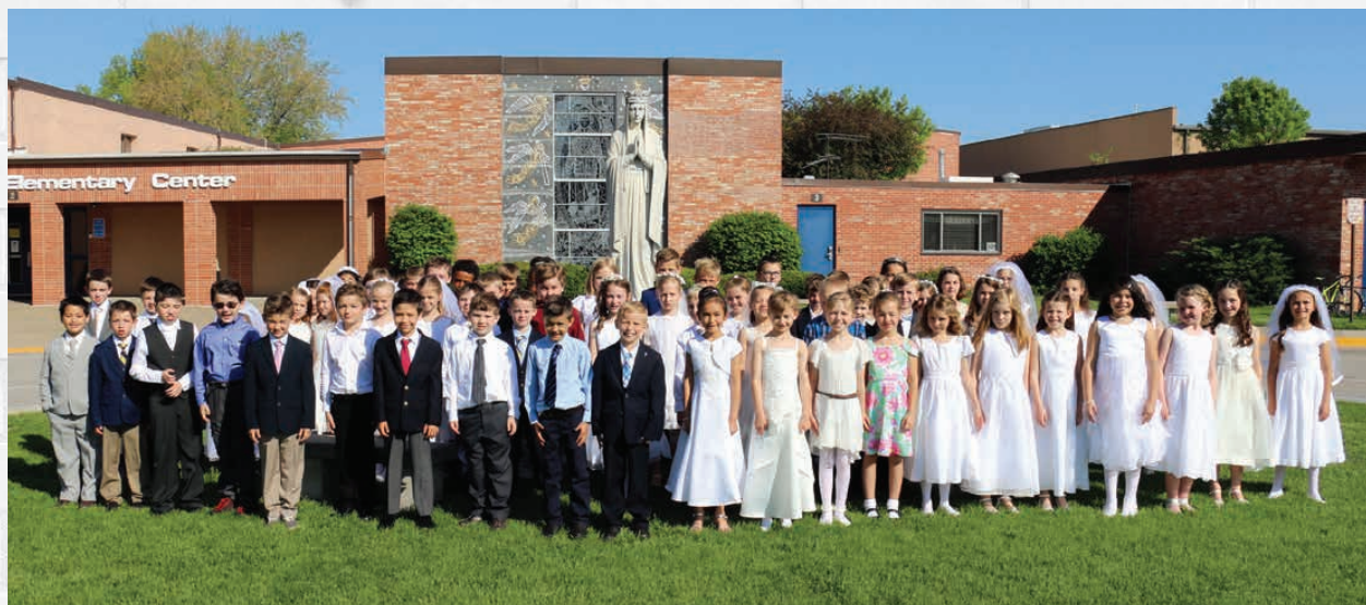
Second graders gather before their First Communion Mass Celebration.