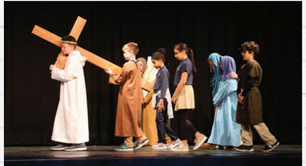
5th graders reenact Stations of the Cross.

Extra-curricular activities supplement the learning activities in our classrooms and provide students a chance to excel and develop other skills. Activities in areas such as art, choir, band, orchestra, drama, and robotics, give students a chance to pursue areas of interest with other students, develop positive student relationships and create a supportive school climate. Most of our junior high and high school students participate in at least one extra-curricular activity