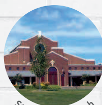
St. Patrick Church

R egina Catholic Education Center is blessed to have four wonderful parishes that support our school. We are grateful for their partnership and the care they give in time, talent, and treasure.