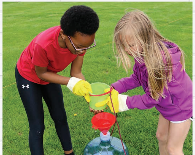
Elementary students have fun on Track and Field Day.

Regina is also deeply rooted in serving the community. All students are provided with opportunities to learn how to become a servant leader who serves the Church and the greater Iowa City area community, thus preparing Regina High School graduates to go out and serve the world!