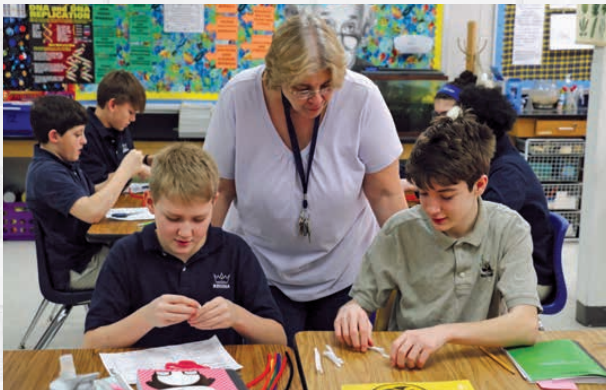
7th grade students build DNA models.

For 60 years, the Regina Catholic Education Center has been dedicated to making a difference — in our students' lives, in our community and in our world. We have created an educational environment that is learner-centered; values-rich; proudly steeped in our Catholic identity; service-oriented; and bold and fearless when considering new possibilities.